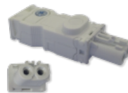
Wieland female connector part no. 400702