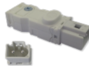
Wieland male connector part no. 400703